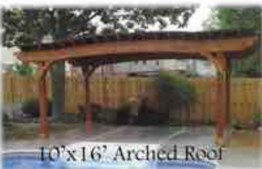
10'x16' Arched Roof