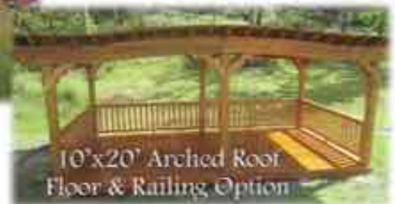
10'x20' Arched Roof Floor & Railing Option

Built from quality pressure treated lumber!