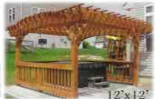
12'x12' Arched w/ Clear Roof