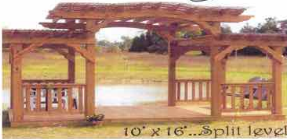
10' x 16'... Split level